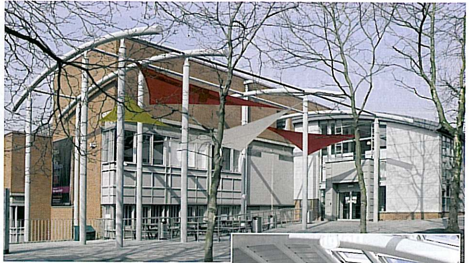
Views of the Bonington Building at Nottingham Trent University